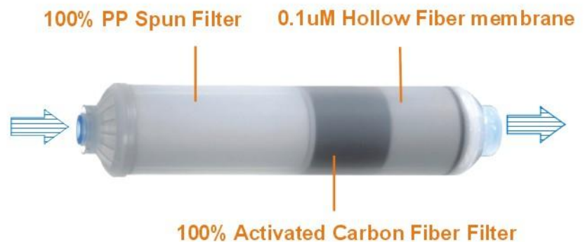
# T - MAF