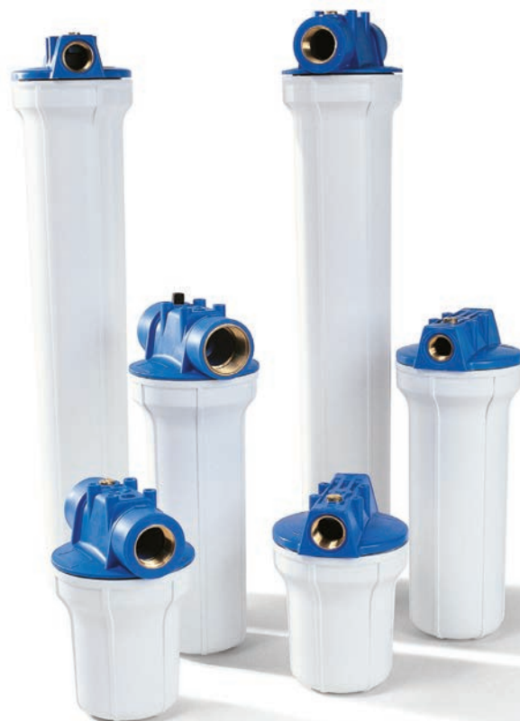
mod. 122 - mod 122