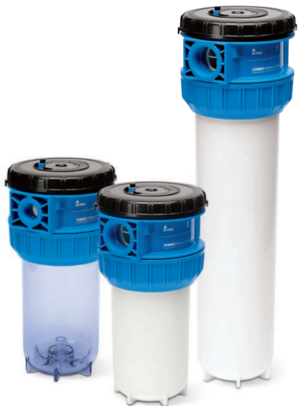
mod. BP - mod BP