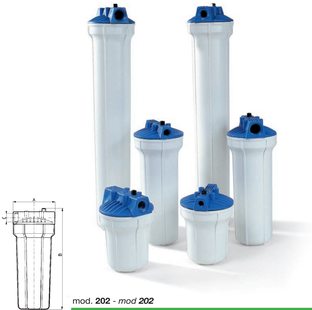
mod. 202 - mod 202

CONTENITORE IN 2 PEZZI, TESTA STAFFABILE / 2 PIECE HOUSING, BRACKET MOUNTABLE HEAD